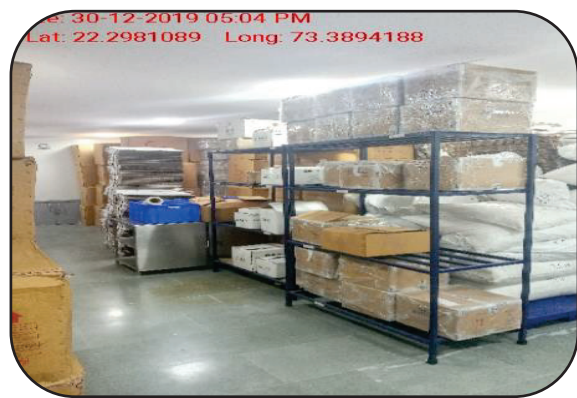
Raw Material Stock