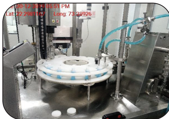
Critical Machines for Production