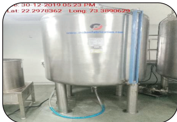
Critical Machines for Production