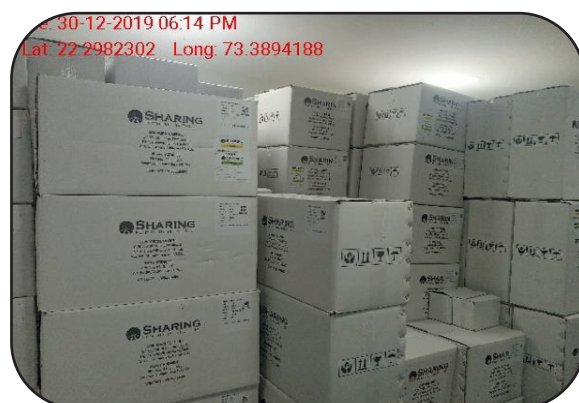
Safe Packaging for Defect Free Delivery of Products