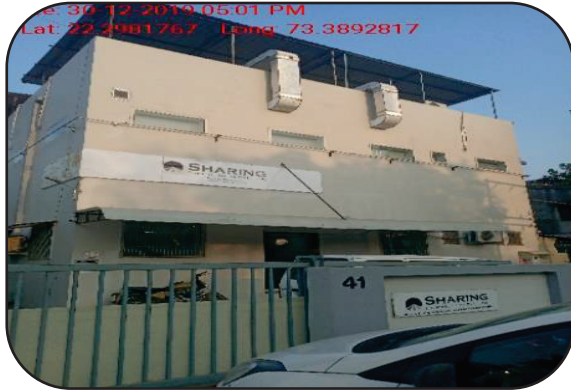
Physical Location: Outside of the Firm